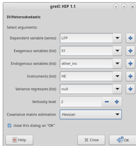
Figure 1: HIP GUI hook